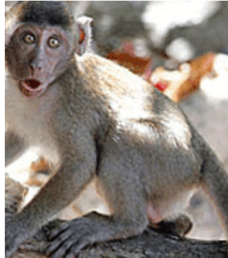
9.20 Animal Behavior