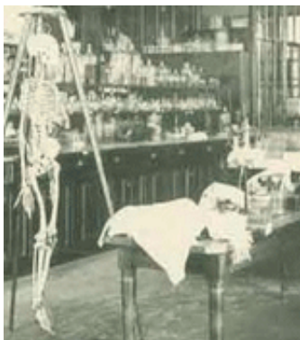
STS.004 Science, Technology, & World