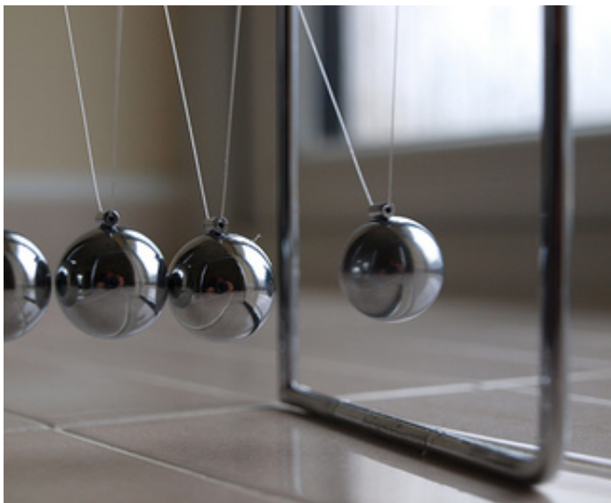
Image of Newton's cradle which demonstrates conservation of momentum and energy.